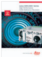
Leica GRX1200+ Series Technical Data

Illustrations, descriptions and technical specifications are not binding and may change. Printed in Switzerland – Copyright Leica Geosystems AG, Heerbrugg, Switzerland, 2010. 746092en – II.1.0 – RDV