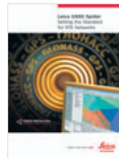
Leica GNSS Spider Product brochure