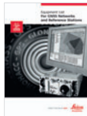
Leica Reference Stations Equipment list