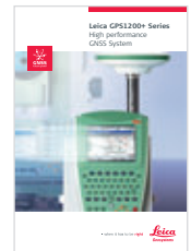
Leica GPS1200+ Series Product brochure